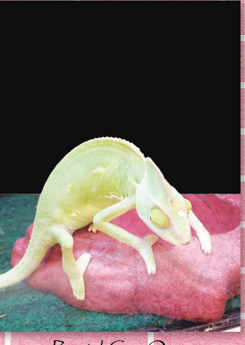
Partial Cut Out